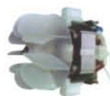
Optional AC motor

Power: 110- 127V 220-240V 50/60Hz 1600- 1800W Professional hair dryer With AC motor 2 speed & 3 heating Cool shot function removable filter cover With concentrator and diffuser Hanging loop Gift-box size: 25* 10* 25cm Carton size: 27* 62* 52CM Qty: 12PC S/C TN GW/NW: 13.5/11.5KGS 4212PC S/20FT, 9396PC S/40FT CE/GS/ROHS