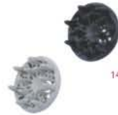
140mm large Finger diffuser

Power: 110-127V 220-240V 50/60Hz 1800-2200W Professional hair dryer With DC motor 2 speed & 3 heating /cool settings Cool shot function removable filter cover With concentrator and diffuser Hanging loop Gift-box size:23*9*24.5cm Carton size:49*56*26CM Qty:12PCS/C TN GW/NW:12/10KGS 3720PCS/20FT,7200PCS/40FT CE/GS/R.OHS