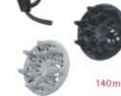
140mm large Finger diffuser