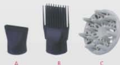
A flat mouth for men's use B comb mouth for straightening long hair C 140mm large Finger diffuser

Motor: The new XDS motor is built with innovative geometry to reduce energy consumption, permit greater duration duration with less weight. Durability.... 1520 hours