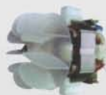
Optional: AC motor

Motor: The new XDS motor is built with innovative geometry to reduce energy consumption, permit greater duration duration with less weight. Durability.... 1520 hours