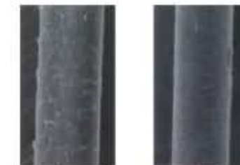
Hair without Ionic