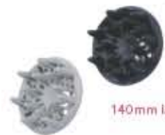
140mm large Finger diffuser