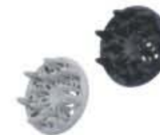
Inner nozzle-fast dry&perfect styling