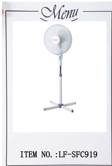
16inch Stand fan

Motor size:66*66*14 Voltage/Frequency:AC 110~240V/50~60Hz Blades material:3/4 Blades (PP/ABS) Switch:3 Speed Blade holder: RPM/Min:1200/1100/1000