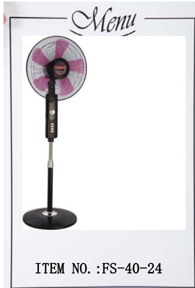
16inch Stand fan

Motor size:66*66*14 Voltage/Frequency:AC 110~240V/50~60Hz Blades material:3/4 Blades (PP/ABS) Switch:3 Speed Blade holder: RPM/Min:1200/1100/1000