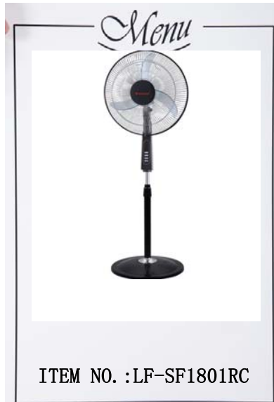
18inch Stand fan

Motor size:66*66*14 Voltage/Frequency:AC 110~240V/50~60Hz Blades material:3/4 Blades (PP/ABS) Switch:3 Speed Blade holder: RPM/Min:1200/1100/1000