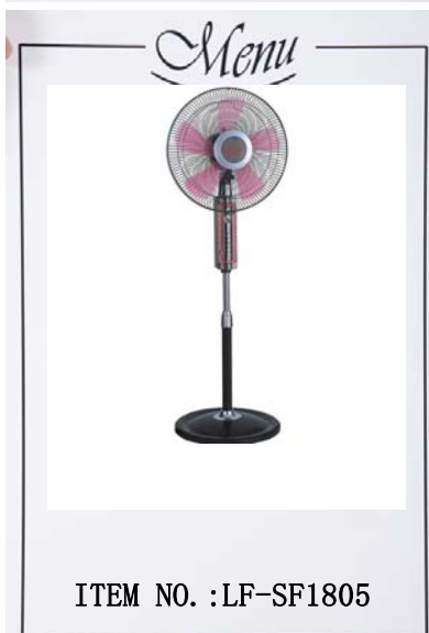
18inch Stand fan

Motor size:66*66*14 Voltage/Frequency:AC 110~240V/50~60Hz Blades material:3/4 Blades (PP/ABS) Switch:3 Speed Blade holder: RPM/Min:1200/1100/1000