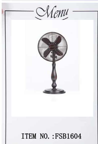
16inch Stand fan

Motor size:66*66*14 Voltage/Frequency:AC 110~240V/50~60Hz Blades material:4 Blades (Iron/Aluimium) Switch:3 Speed Blade holder:Mesh plate RPM/Min:1200/1100/1000