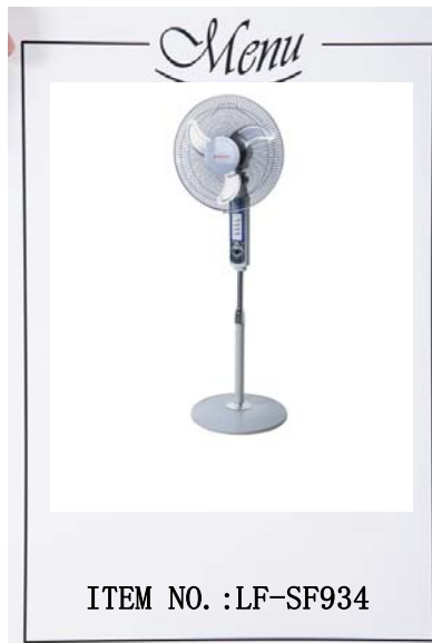
16inch Stand fan

Motor size:66*66*14 Voltage/Frequency:AC 110~240V/50~60Hz Blades material:3/4 Blades (PP/ABS) Switch:3 Speed Blade holder: RPM/Min:1200/1100/1000