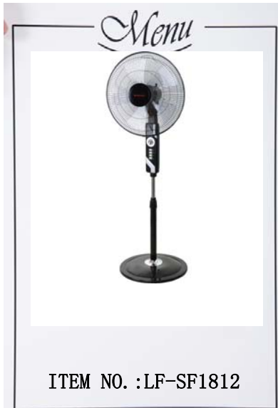
18inch Stand fan

Motor size:66*66*14 Voltage/Frequency:AC 110~240V/50~60Hz Blades material:3/4 Blades (PP/ABS) Switch:3 Speed Blade holder: RPM/Min:1200/1100/1000