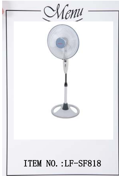
18inch Stand fan

Motor size: 66*66*14 Voltage/Frequency: AC 110~240V/50~60Hz Blades material: 3/4 Blades (PP/ABS) Switch: 3 Speed Blade holder: RPM/Min: 1200/1100/1000