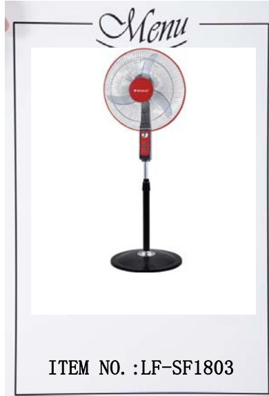
18inch Stand fan

Motor size:66*66*14 Voltage/Frequency:AC 110~240V/50~60Hz Blades material:3/4 Blades (PP/ABS) Switch:3 Speed Blade holder: RPM/Min:1200/1100/1000