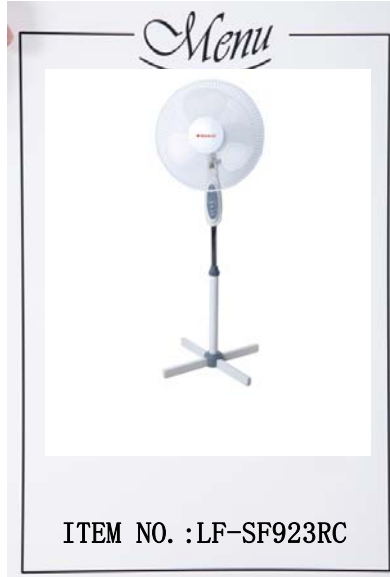
16inch Stand fan

Motor size: 66*66*14 Voltage/Frequency: AC 110~240V/50~60Hz Blades material: 3/4 Blades (PP/ABS) Switch: 3 Speed Blade holder: RPM/Min: 1200/1100/1000