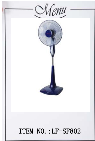
18inch Stand fan

Motor size: 66*66*14 Voltage/Frequency: AC 110~240V/50~60Hz Blades material: 3/4 Blades (PP/ABS) Switch: 3 Speed Blade holder: RPM/Min: 1200/1100/1000