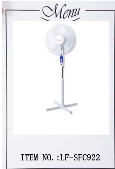
16inch Stand fan

Motor size:66*66*14 Voltage/Frequency:AC 110~240V/50~60Hz Blades material:3/4 Blades (PP/ABS) Switch:3 Speed Blade holder: RPM/Min:1200/1100/1000