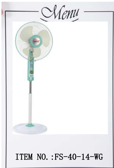
16inch Stand fan

Motor size:66*66*14 Voltage/Frequency:AC 110~240V/50~60Hz Blades material:3/4 Blades (PP/ABS) Switch:3 Speed Blade holder: RPM/Min:1200/1100/1000