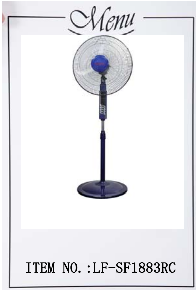
18inch Stand fan

Add:115,NO.11 HUICHENG QIAOLE ROAD.XINHUI DISTRICT JIANGMEN CITY GUANGDONG, CHINA Tel:+86 750 6130021 Fax:+86 750 6130023 E-mail: rocklang@gmail.com & sunidea.rock@gmail.com