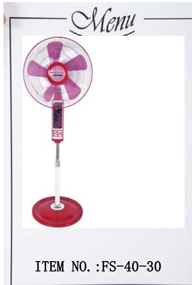
16inch Stand fan

Motor size:66*66*14 Voltage/Frequency:AC 110~240V/50~60Hz Blades material:3/4 Blades (PP/ABS) Switch:3 Speed Blade holder: RPM/Min:1200/1100/1000