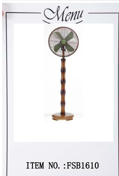
16inch Stand fan

Motor size:66*66*14 Voltage/Frequency:AC 110~240V/50~60Hz Blades material:4 Blades (Iron/Aluimium) Switch:3 Speed Blade holder:Mesh plate RPM/Min:1200/1100/1000