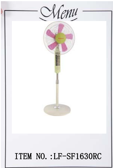
16inch Stand fan

Motor size:66*66*14 Voltage/Frequency:AC 110~240V/50~60Hz Blades material:3/4 Blades (PP/ABS) Switch:3 Speed Blade holder: RPM/Min:1200/1100/1000