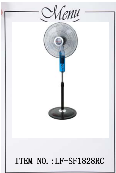
18inch Stand fan

Motor size:66*66*14 Voltage/Frequency:AC 110~240V/50~60Hz Blades material:3/4 Blades (PP/ABS) Switch:3 Speed Blade holder: RPM/Min:1200/1100/1000