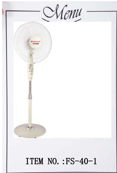
16inch Stand fan

Motor size:66*66*14 Voltage/Frequency:AC 110~240V/50~60Hz Blades material:3/4 Blades (PP/ABS) Switch:3 Speed Blade holder: RPM/Min:1200/1100/1000