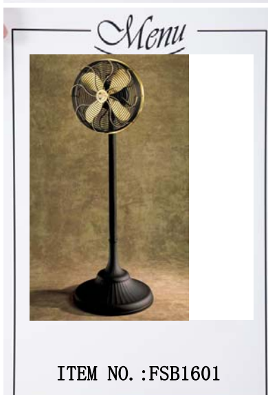
16inch Stand fan

Motor size:66*66*14 Voltage/Frequency:AC 110~240V/50~60Hz Blades material:4 Blades (Iron/Aluimium) Switch:3 Speed Blade holder:Mesh plate RPM/Min:1200/1100/1000