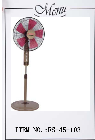
16inch Stand fan

Motor size:66*66*14 Voltage/Frequency:AC 110~240V/50~60Hz Blades material:3/4 Blades (PP/ABS) Switch:3 Speed Blade holder: RPM/Min:1200/1100/1000