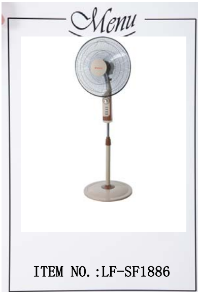
18inch Stand fan

Motor size: 66*66*14 Voltage/Frequency: AC 110~240V/50~60Hz Blades material: 3/4 Blades (PP/ABS) Switch: 3 Speed Blade holder: RPM/Min: 1200/1100/1000