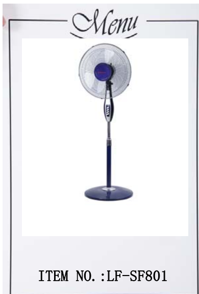
18inch Stand fan

Motor size:66*66*14 Voltage/Frequency:AC 110~240V/50~60Hz Blades material:4 Blades (Iron/Aluimium) Switch:3 Speed Blade holder:Mesh plate RPM/Min:1200/1100/1000