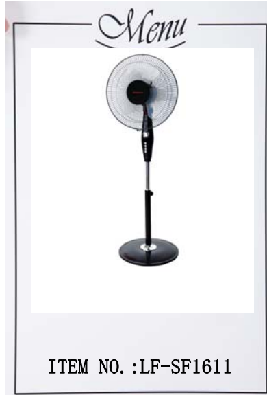
16inch Stand fan

Motor size:66*66*14 Voltage/Frequency:AC 110~240V/50~60Hz Blades material:3/4 Blades (PP/ABS) Switch:3 Speed Blade holder: RPM/Min:1200/1100/1000