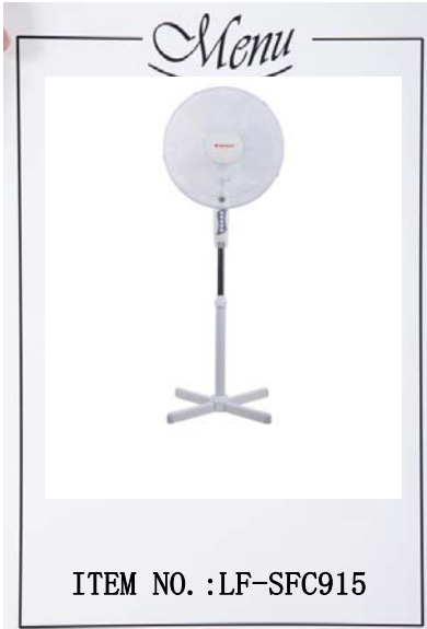
16inch Stand fan

Motor size: 66*66*14 Voltage/Frequency: AC 110~240V/50~60Hz Blades material: 3/4 Blades (PP/ABS) Switch: 3 Speed Blade holder: RPM/Min: 1200/1100/1000