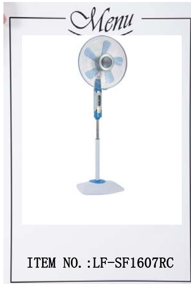
16inch Stand fan

Motor size:66*66*14 Voltage/Frequency:AC 110~240V/50~60Hz Blades material:3/4 Blades (PP/ABS) Switch:3 Speed Blade holder: RPM/Min:1200/1100/1000