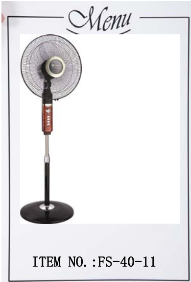
16inch Stand fan

Motor size:66*66*14 Voltage/Frequency:AC 110~240V/50~60Hz Blades material:3/4 Blades (PP/ABS) Switch:3 Speed Blade holder: RPM/Min:1200/1100/1000