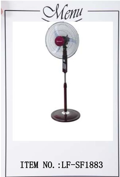
18inch Stand fan

Motor size:66*66*14 Voltage/Frequency:AC 110~240V/50~60Hz Blades material:3/4 Blades (PP/ABS) Switch:3 Speed Blade holder: RPM/Min:1200/1100/1000