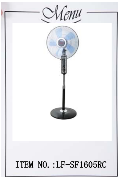
16inch Stand fan

Motor size:66*66*14 Voltage/Frequency:AC 110~240V/50~60Hz Blades material:3/4 Blades (PP/ABS) Switch:3 Speed Blade holder: RPM/Min:1200/1100/1000