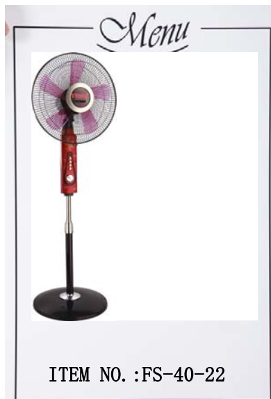
16inch Stand fan

Motor size:66*66*14 Voltage/Frequency:AC 110~240V/50~60Hz Blades material:3/4 Blades (PP/ABS) Switch:3 Speed Blade holder: RPM/Min:1200/1100/1000