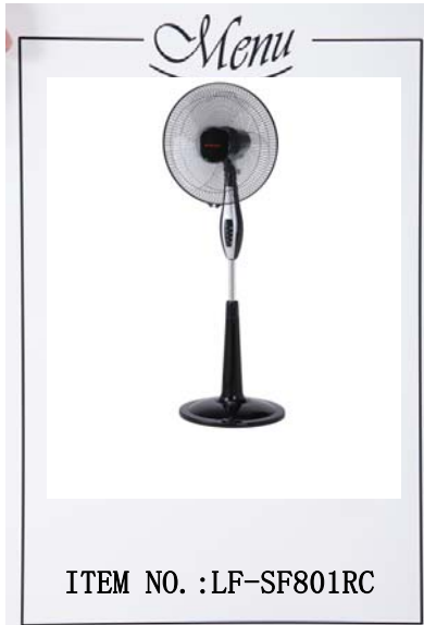
18inch Stand fan

Add:115,NO.11 HUICHENG QIAOLE ROAD.XINHUI DISTRICT JIANGMEN CITY GUANGDONG, CHINA Tel:+86 750 6130021 Fax:+86 750 6130023 E-mail: rocklang@gmail.com & sunidea.rock@gmail.com