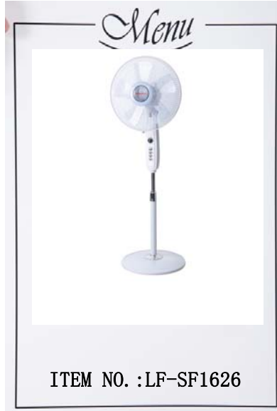
16inch Stand fan

Motor size:66*66*14 Voltage/Frequency:AC 110~240V/50~60Hz Blades material:3/4 Blades (PP/ABS) Switch:3 Speed Blade holder: RPM/Min:1200/1100/1000