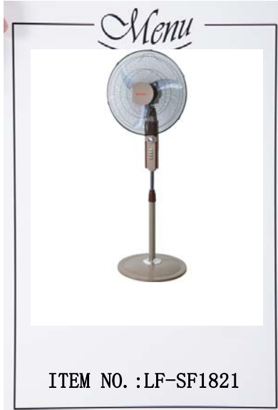
18inch Stand fan

Add:115, NO. 11 HUICHENG QIAOLE ROAD. XINHUI DISTRICT JIANGMEN CITY GUANGDONG, CHINA Tel:+86 750 6130021 Fax:+86 750 6130023 E-mail: rocklang@gmail.com & sunidea.rock@gmail.com