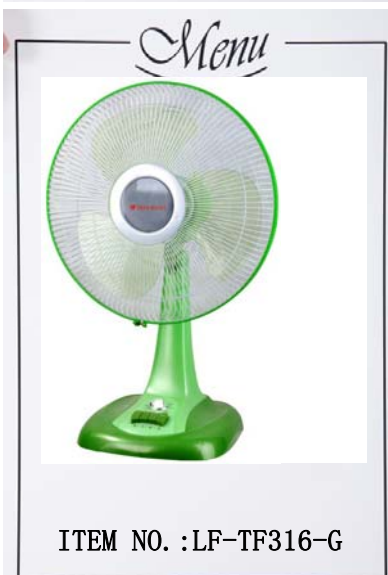
16inch Table fan

Motor size:66*66*14 Color:Any Voltage/Frequency:AC 110~240V/50~60Hz Blades material:3/4/5 Blades (PP/ABS) Switch:3 Speed Blade holder:Mesh plate RPM/Min:1200/1100/1000