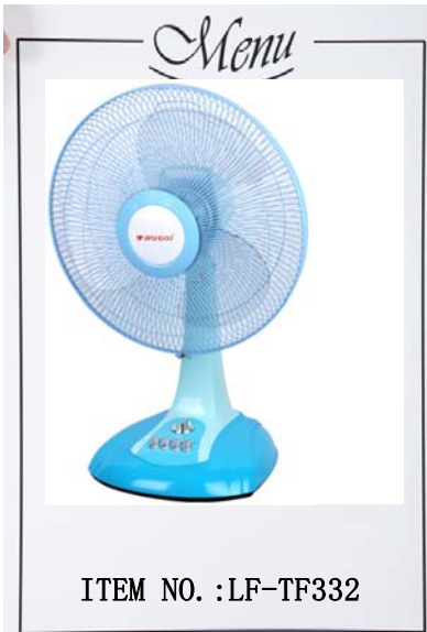
16inch Table fan

Motor size:66*66*14 Color:Any Voltage/Frequency:AC 110~240V/50~60Hz Blades material:3/4/5 Blades (PP/ABS) Switch:3 Speed Blade holder:Mesh plate RPM/Min:1200/1100/1000