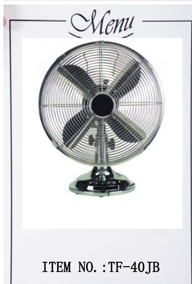
16inch Table fan

Motor size:66*66*14 Color:Any Voltage/Frequency:AC 110~240V/50~60Hz Blades material:3/4/5 Blades (PP/ABS) Switch:3 Speed Blade holder:Mesh plate RPM/Min:1200/1100/1000