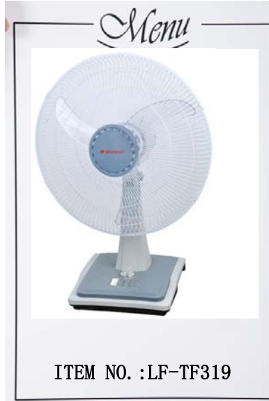
16inch Table fan

Motor size:66*66*14 Color:Any Voltage/Frequency:AC 110~240V/50~60Hz Blades material:3/4/5 Blades (PP/ABS) Switch:3 Speed Blade holder:Mesh plate RPM/Min:1200/1100/1000