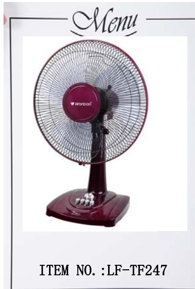
16inch Table fan

Motor size:66*66*14 Color:Any Voltage/Frequency:AC 110~240V/50~60Hz Blades material:3/4/5 Blades (PP/ABS) Switch:3 Speed Blade holder:Mesh plate RPM/Min:1200/1100/1000