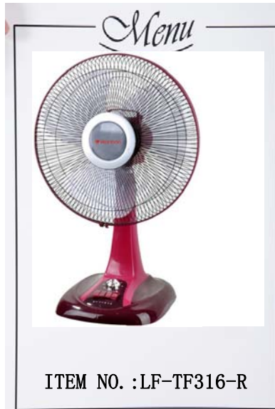
16inch Table fan

Motor size:66*66*14 Color:Any Voltage/Frequency:AC 110~240V/50~60Hz Blades material:3/4/5 Blades (PP/ABS) Switch:3 Speed Blade holder:Mesh plate RPM/Min:1200/1100/1000