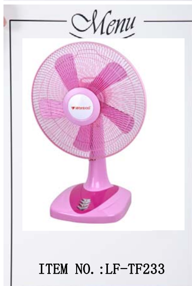
16inch Table fan

Motor size:66*66*14 Color:Any Voltage/Frequency:AC 110~240V/50~60Hz Blades material:3/4/5 Blades (PP/ABS) Switch:3 Speed Blade holder:Mesh plate RPM/Min:1200/1100/1000