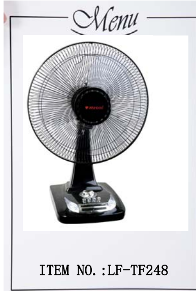
16inch Table fan

Motor size:66*66*14 Color:Any Voltage/Frequency:AC 110~240V/50~60Hz Blades material:3/4/5 Blades (PP/ABS) Switch:3 Speed Blade holder:Mesh plate RPM/Min:1200/1100/1000