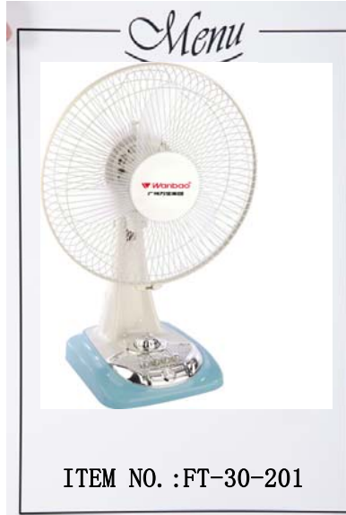
16inch Table fan

Motor size:66*66*14 Color:Any Voltage/Frequency:AC 110~240V/50~60Hz Blades material:3/4/5 Blades (PP/ABS) Switch:3 Speed Blade holder:Mesh plate RPM/Min:1200/1100/1000