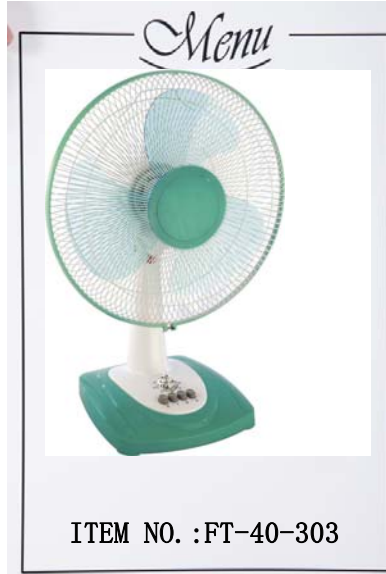
16inch Table fan

Motor size:66*66*14 Color:Any Voltage/Frequency:AC 110~240V/50~60Hz Blades material:3/4/5 Blades (PP/ABS) Switch:3 Speed Blade holder:Mesh plate RPM/Min:1200/1100/1000