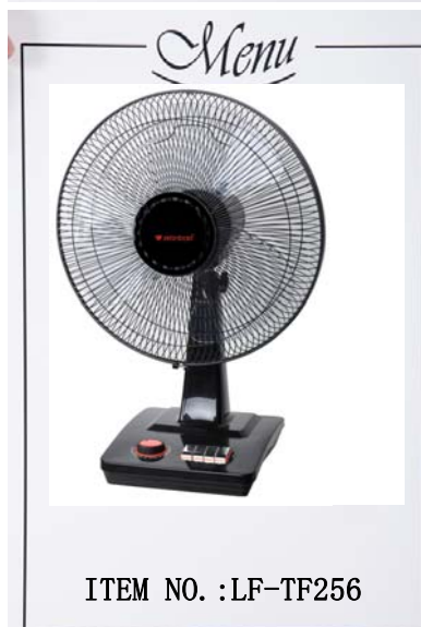
16inch Table fan

Motor size:66*66*14 Color:Any Voltage/Frequency:AC 110~240V/50~60Hz Blades material:3/4/5 Blades (PP/ABS) Switch:3 Speed Blade holder:Mesh plate RPM/Min:1200/1100/1000