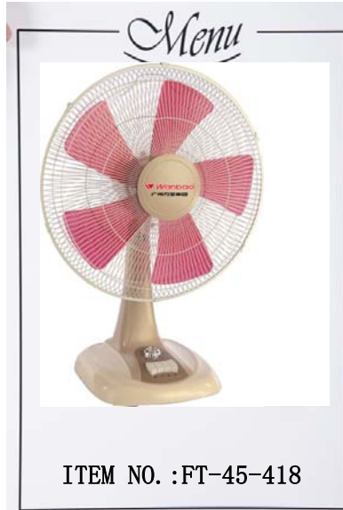
16inch Table fan

Motor size:66*66*14 Color:Any Voltage/Frequency:AC 110~240V/50~60Hz Blades material:3/4/5 Blades (PP/ABS) Switch:3 Speed Blade holder:Mesh plate RPM/Min:1200/1100/1000