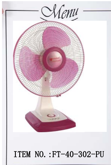
16inch Table fan

Motor size:66*66*14 Color:Any Voltage/Frequency:AC 110~240V/50~60Hz Blades material:3/4/5 Blades (PP/ABS) Switch:3 Speed Blade holder:Mesh plate RPM/Min:1200/1100/1000