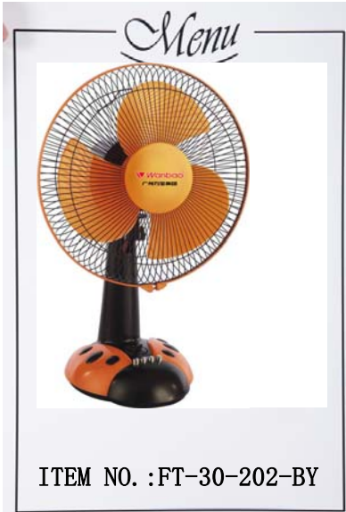
16inch Table fan

Motor size:66*66*14 Color:Any Voltage/Frequency:AC 110~240V/50~60Hz Blades material:3/4/5 Blades (PP/ABS) Switch:3 Speed Blade holder:Mesh plate RPM/Min:1200/1100/1000