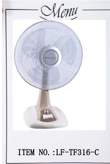
16inch Table fan

Motor size:66*66*14 Color:Any Voltage/Frequency:AC 110~240V/50~60Hz Blades material:3/4/5 Blades (PP/ABS) Switch:3 Speed Blade holder:Mesh plate RPM/Min:1200/1100/1000