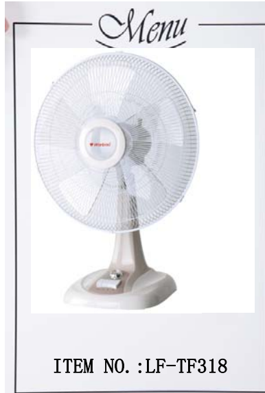
16inch Table fan

Motor size:66*66*14 Color:Any Voltage/Frequency:AC 110~240V/50~60Hz Blades material:3/4/5 Blades (PP/ABS) Switch:3 Speed Blade holder:Mesh plate RPM/Min:1200/1100/1000