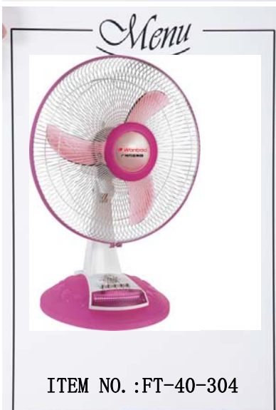
16inch Table fan

Motor size:66*66*14 Color:Any Voltage/Frequency:AC 110~240V/50~60Hz Blades material:3/4/5 Blades (PP/ABS) Switch:3 Speed Blade holder:Mesh plate RPM/Min:1200/1100/1000