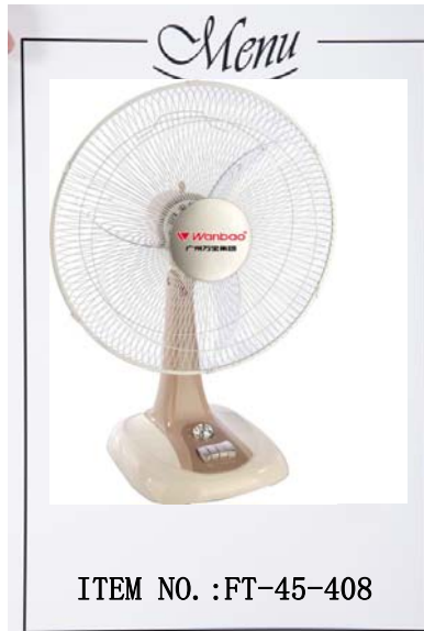
16inch Table fan

Motor size:66*66*14 Color:Any Voltage/Frequency:AC 110~240V/50~60Hz Blades material:3/4/5 Blades (PP/ABS) Switch:3 Speed Blade holder:Mesh plate RPM/Min:1200/1100/1000