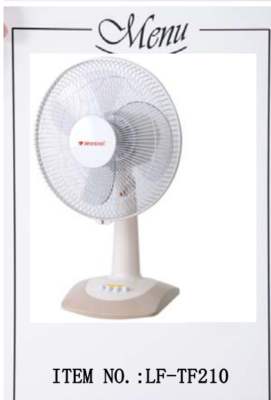
16inch Table fan

Motor size:66*66*14 Color:Any Voltage/Frequency:AC 110~240V/50~60Hz Blades material:4 Blades (Iron/Alumium) Switch:3 Speed Blade holder:Mesh plate RPM/Min:1200/1100/1000