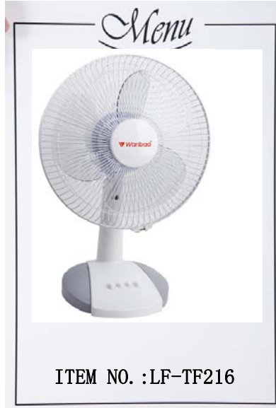
16inch Table fan

Motor size:66*66*14 Color:Any Voltage/Frequency:AC 110~240V/50~60Hz Blades material:3/4/5 Blades (PP/ABS) Switch:3 Speed Blade holder:Mesh plate RPM/Min:1200/1100/1000