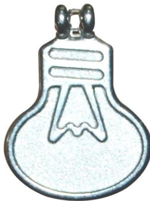
Light Switch Medallion