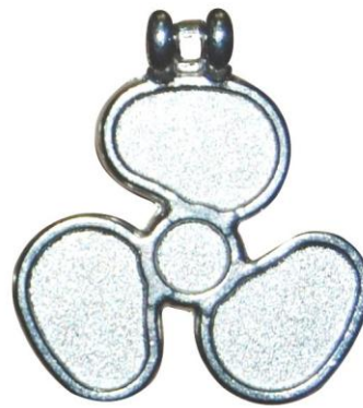
Speed Switch Medallion